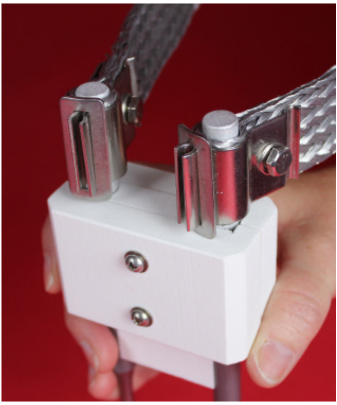
125-Amp straps are connected to MoSi<sub>2</sub> Element terminals with their integral stainless steel clamp.