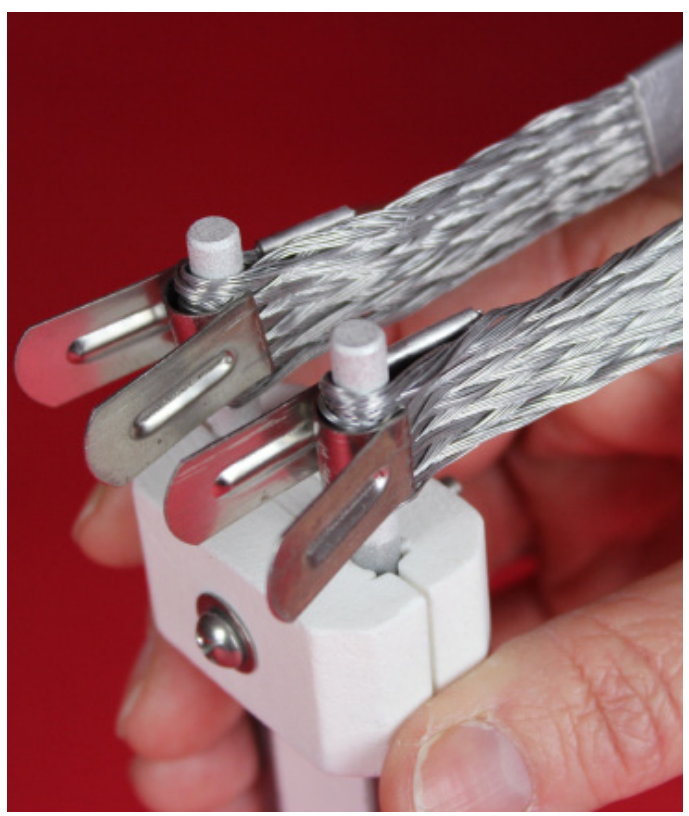
50-Amp straps are connected to MoSi<sub>2</sub> Element terminals with the use of a Manual Terminal Clamp Type MTC.