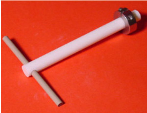
Pictured above are: Shaft Collar Type SC-1; Hanger Rod Type HR-2; Hanger Rod Type HR-3M

Custom preparations are available on request.