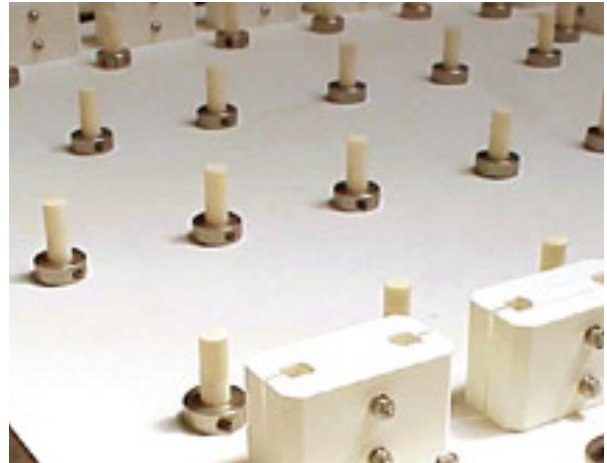
Shaft Collar Type SC-1 plays an integral part in the support of multi-layers insulation systems.